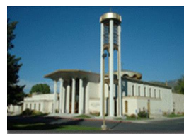
Prophet Elias Church