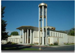
Prophet Elias Church